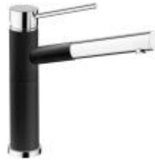
BLANCO ALTA DUAL SPRAY