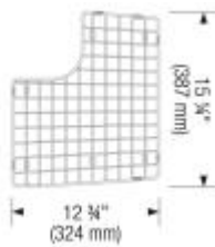
Stainless Steel Sink Grid