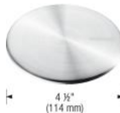
3/2" CapFlow strainer cover

Stainless steel (fits all BLANCO strainers)