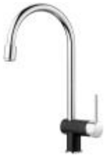
BLANCO RITA DUAL SPRAY